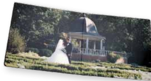
E. FULL PANORAMIC - THE BACK OF THE PANORAMIC HOLDS A MAT