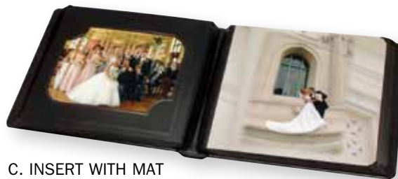
C. INSERT WITH MAT