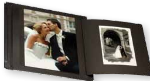
F. EXTENSION MAT