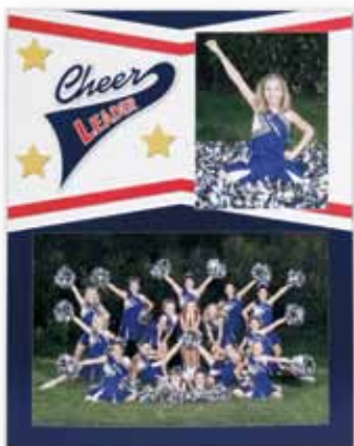
A. CHEERLEADER MEMORY MATE