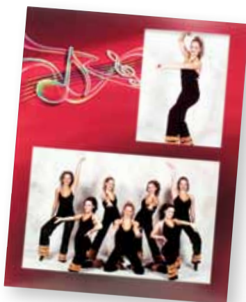
B. MUSICAL MEMORY MATE