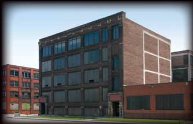
Manufacturing and Corporate Headquarters Superior Avenue - Cleveland, OH.

Tap Packaging Solutions 2160 Superior Ave. E Cleveland, Ohio 44114-2184 Toll Free: 800.827.5679 Local: 216.781.6000 Fax: 800.276.2572