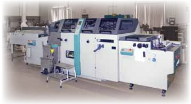
DA Case Making Machine - San Antonio, TX.

Challenge us with your next packaging project and let us show you how TAP Packaging Solutions can help to drive your profits.