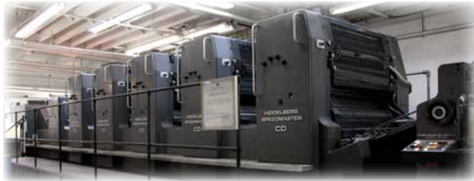
Heidelberg Speedmaster Offset Presses - Cleveland, OH.