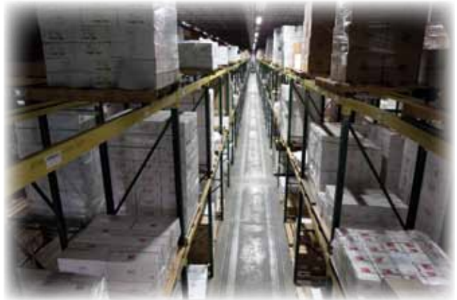
Inventory Management - Fullfillment