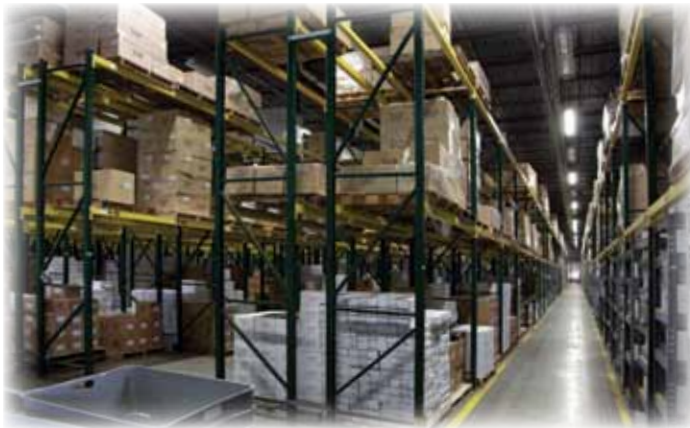
Warehousing - Cleveland, OH.